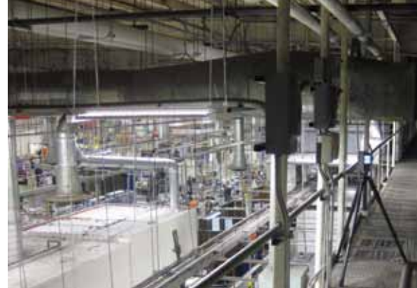
The first FARO Focus3D™ Laser Scanner delivered to the USA scanning a manufacturing plant in support of a MEP seismic retrofit. Can you imagine designing and locating over 1000 seismic braces in a busy plant like this?

The typical approach to evaluating MEP systems is to send designers and/or engineers to the facility where they go through and confirm drawings by eyeball from a distance, and crawl (often literally) through the suspended maze of piping, wiring, and duct work to measure and document the existing MEP systems and their restraints. This information is then used to develop estimates and construction packages for the retrofit work. Because of the complexity of